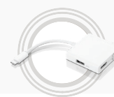
Lenovo USB-C 3-in-1 Hub