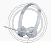
Lenovo 100 Stereo Analog Headset