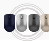
Lenovo 540 USB-C Wireless Compact Mouse