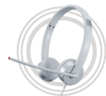
Lenovo 100 Stereo Analog Headset