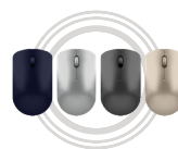
Lenovo 540 USB-C Wireless Compact Mouse