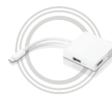
Lenovo USB-C 3-in-1 Hub