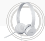
Lenovo 110 USB Stereo Headset