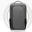
Lenovo 15.6" Laptop Urban Backpack B530