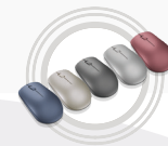
Lenovo 530 Wireless Mouse