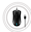
Legion M300 RGB Gaming Mouse