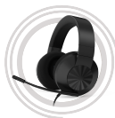
Legion H200 Gaming Headset