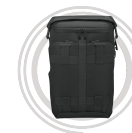
Legion Active Gaming Backpack

* Example of Lenovo marketing catalogue naming convention