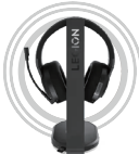
Lenovo S600 Gaming Station