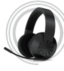
Lenovo H600 Wireless Gaming Headset