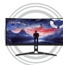
Lenovo Y34wz-30 Monitor