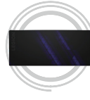
Lenovo Gaming Control Mouse Pad XXL