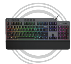
Lenovo K500 RGB Mechanical keyboard