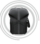
Lenovo 16" Functional Gaming Backpack GB700

* Example of Lenovo catalogue naming convention