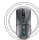
Lenovo M600s Qi Wireless Gaming Mouse