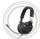
Lenovo Ideapad Gaming H100 Headset