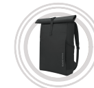
Lenovo IdeaPad Gaming Modern Backpack