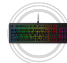
Lenovo Legion K310 RGB Gaming keyboard