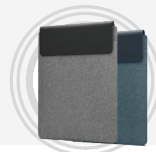
Lenovo Yoga Sleeves