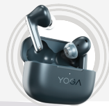
Lenovo Yoga True Wireless Stereo Earbuds