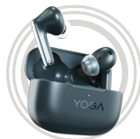
Lenovo Yoga True Wireless Stereo Earbuds