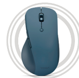
Lenovo Yoga Pro Mouse